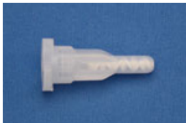
3mm x 6 Element Blunt Tip