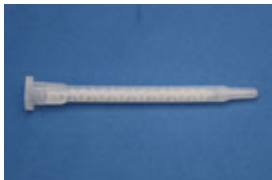
4.6mm x 16 Element Blunt Tip