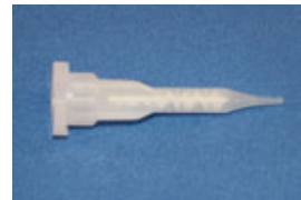
3mm x 8 Element Needle Tip