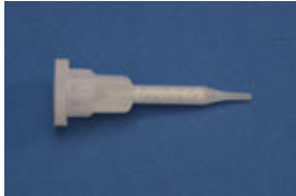
2mm x 8 Element Needle Tip

Static mixers in 2, 3, or 4.6mm diameter with 6, 8, 12, or 16 elements. Blunt or needle nose options. Designed for minimal waste, reduced dispensing force, and reliable mixing.