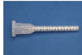
3mm x 16 Element Blunt Tip