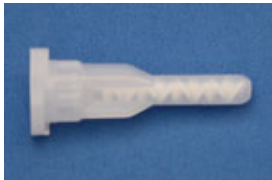
3mm x 8 Element Blunt Tip